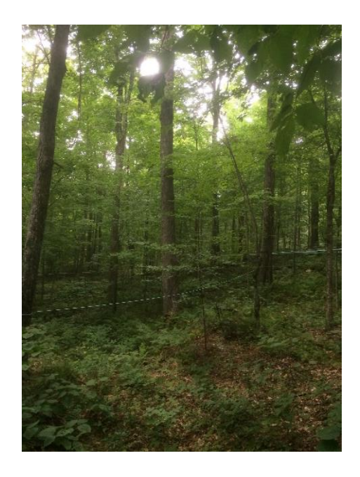
Nicely develop sugarbush habitat structure