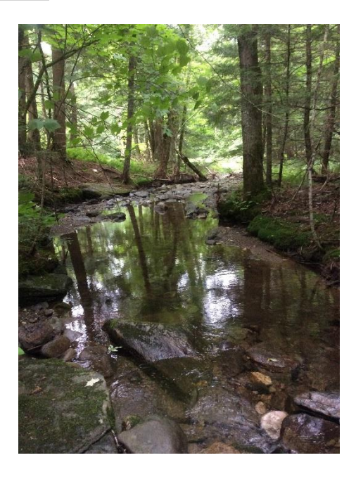
Mountain Brook offers possible Louisiana Waterthrush habitat