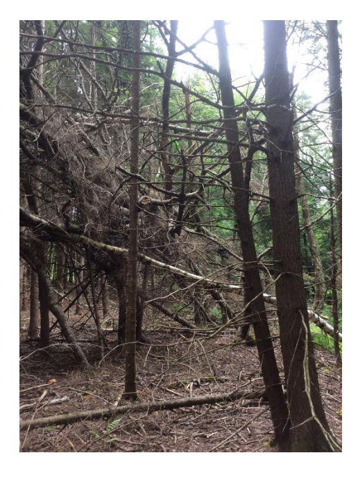
Natural disturbance leading to down woody material