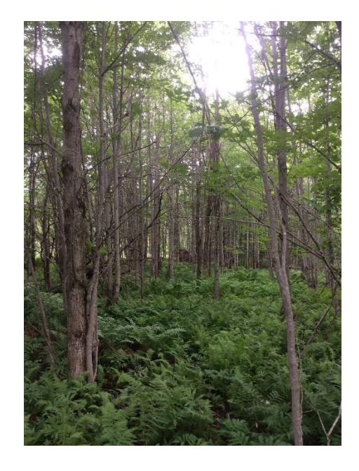
Stand 5 where young forest habitat creation occurred